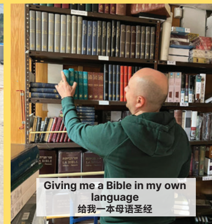
Giving me a Bible in my own language 给我一本母语圣经