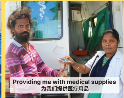
Providing me with medical supplies 为我们提供医疗用品