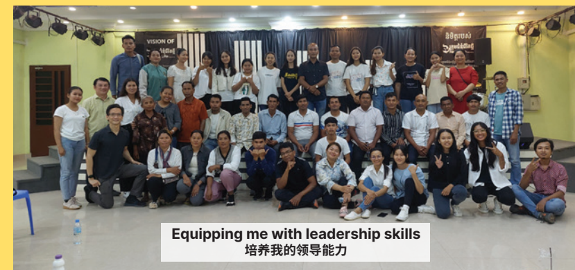
Equipping me with leadership skills 培养我的领导能力