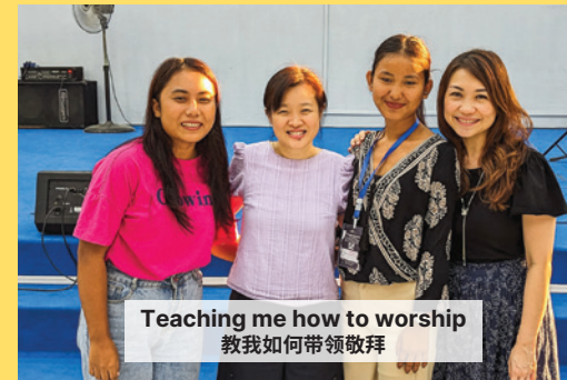
Teaching me how to worship 教我如何带领敬拜