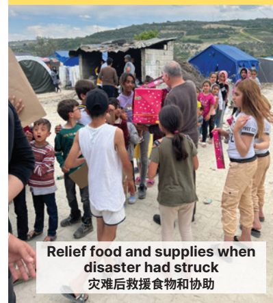
Relief food and supplies when disaster had struck 灾难后救援食物和协助