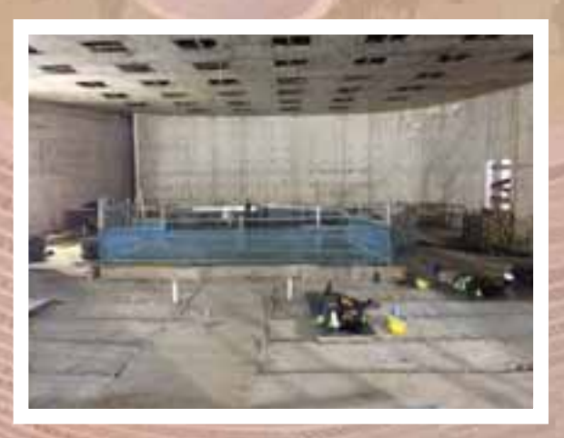
L1 Chinese Worship Hall